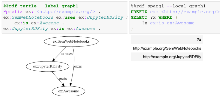
Fig. 2. Using Jupyter-RDFify: The left cell parses and visualizes an RDF graph given in Turtle format, the right cell queries the graph parsed from the left cell and outputs the variable bindings.